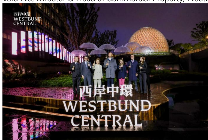
Photo 2: The Phase Two commercial launch introduces a diverse mix of global first stores, designer labels, and flagship concepts that reinforce Westbund Central’s position as a new downtown in Shanghai.